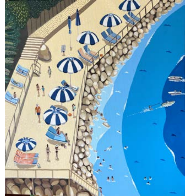
Kids, 2022 Acrylic on canvas 70 x 75 cm