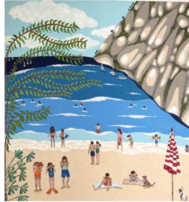
Watermelon Love, 2022 Acrylic on canvas 70 x 75 cm