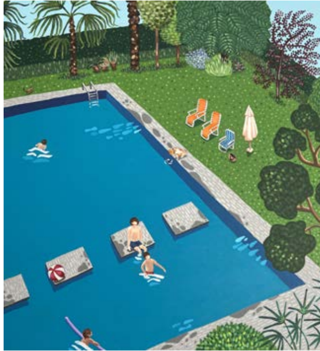
Beach Life, 2022 Acrylic on canvas 70 x 75 cm