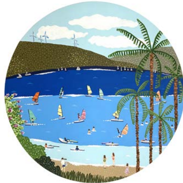
Surfers Paradise, 2022 Acrylic on canvas D 60 cm