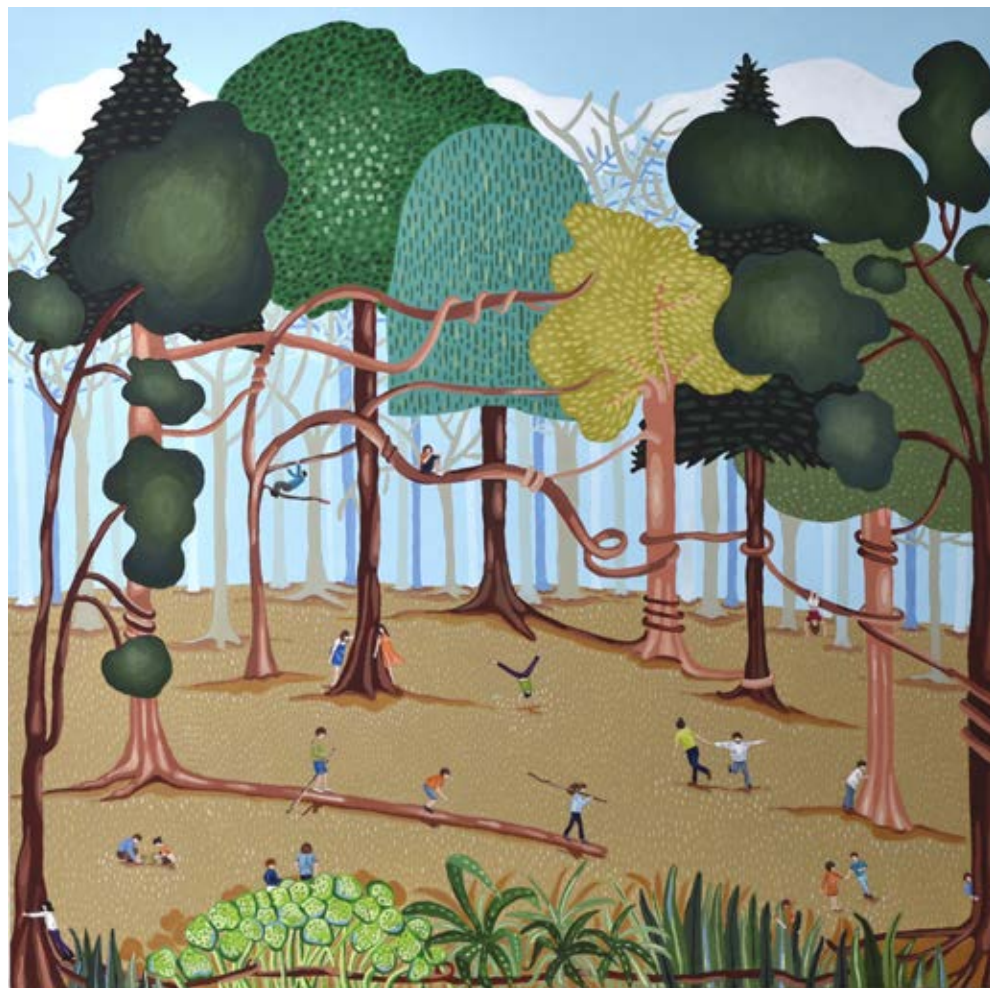
Wonderland, 2022 Acrylic on canvas 120 x 120 cm