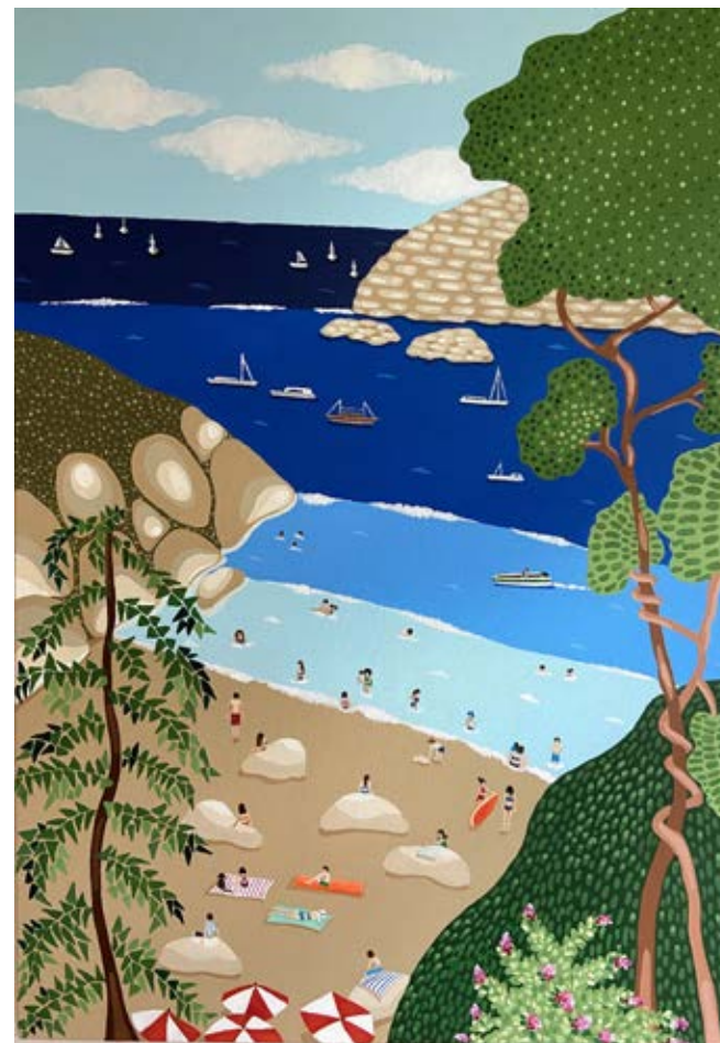
Beachin', 2022 Acrylic on canvas 100 x 70 cm