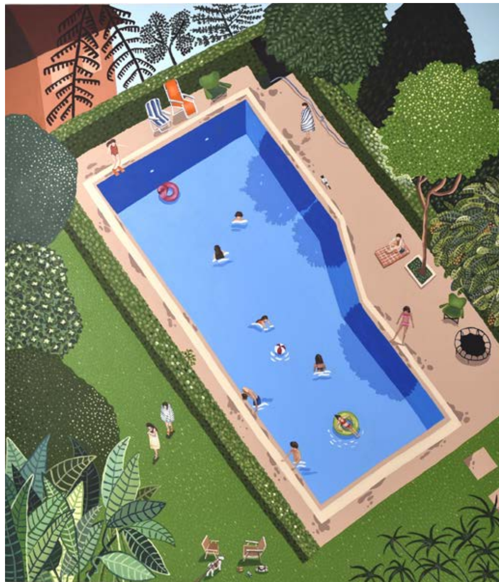
Pool Gang, 2022 Acrylic on canvas 150 x 130 cm