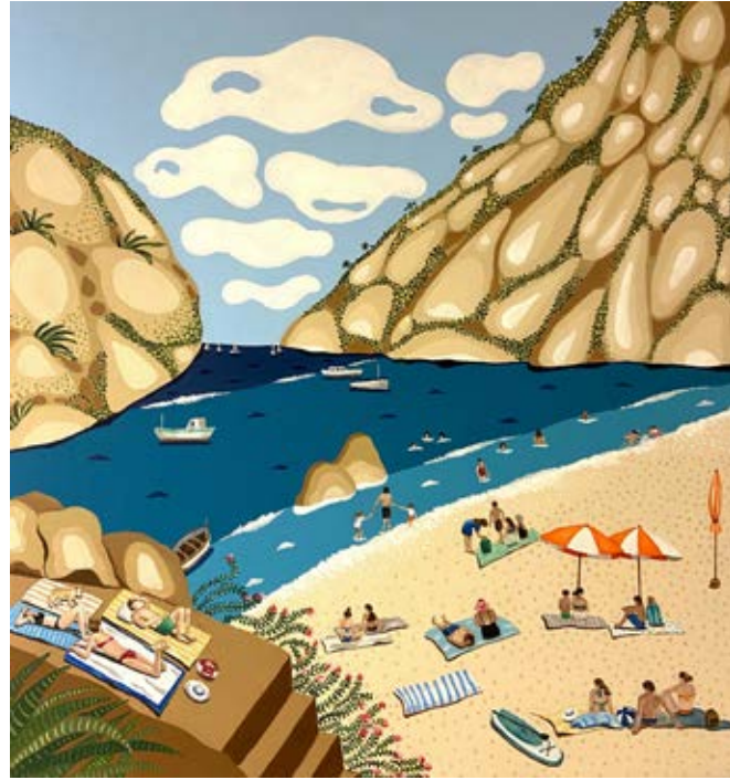
Daydream, 2022 Acrylic on canvas 70 x 75 cm