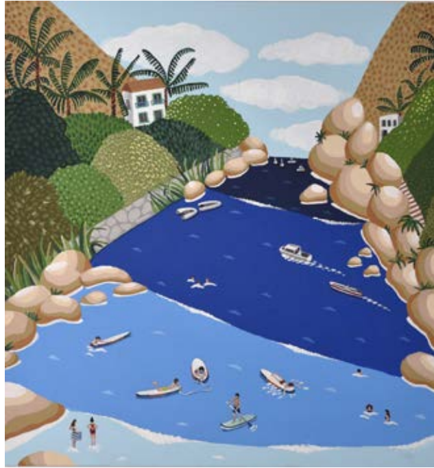
Paddle Fun, 2022 Acrylic on canvas 70 x 75 cm