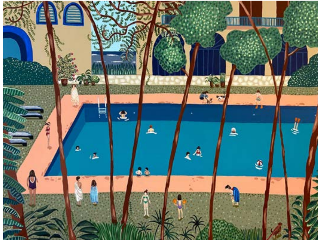
Pool Day, 2022 Acrylic on canvas 70 x 100 cm