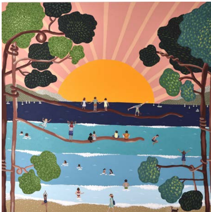
Walking on the Sun, 2022 Acrylic on canvas 100 x 100 cm