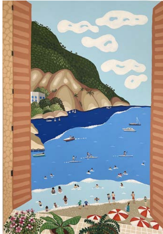
From my Window, 2022 Acrylic on canvas 100 x 70 cm