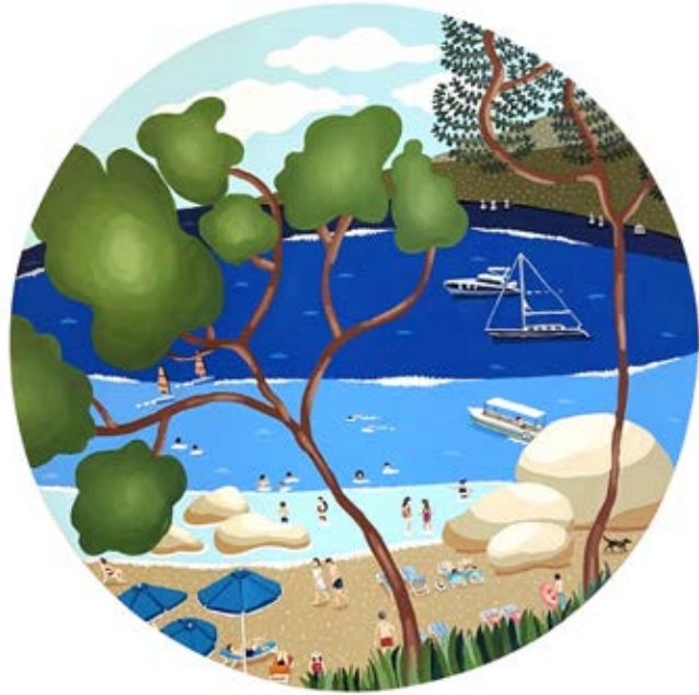
Lazy Sunday, 2022 Acrylic on canvas D 60 cm