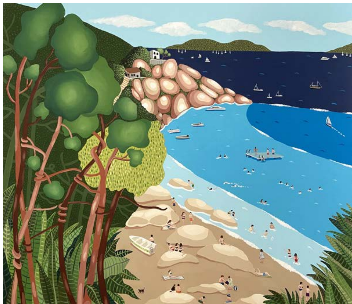
My Paradise, 2022 Acrylic on canvas 130 x 150 cm